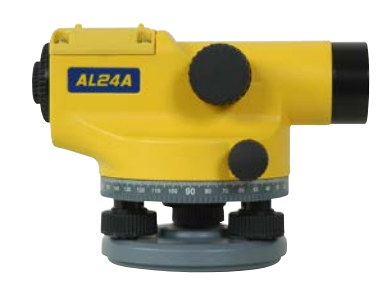
Air Damped Model