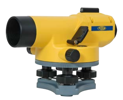
Magnetic Damped Model