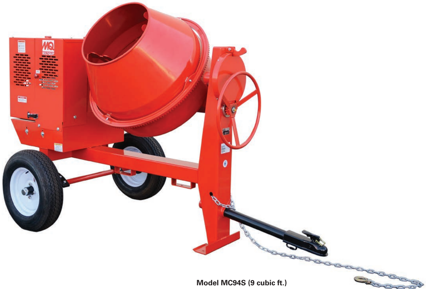
Model MC94S (9 cubic ft.)

Multiquip concrete mixers are available with either steel or polyethylene drums. Their durable construction and low maintenance requirements will provide you with years of reliable service.