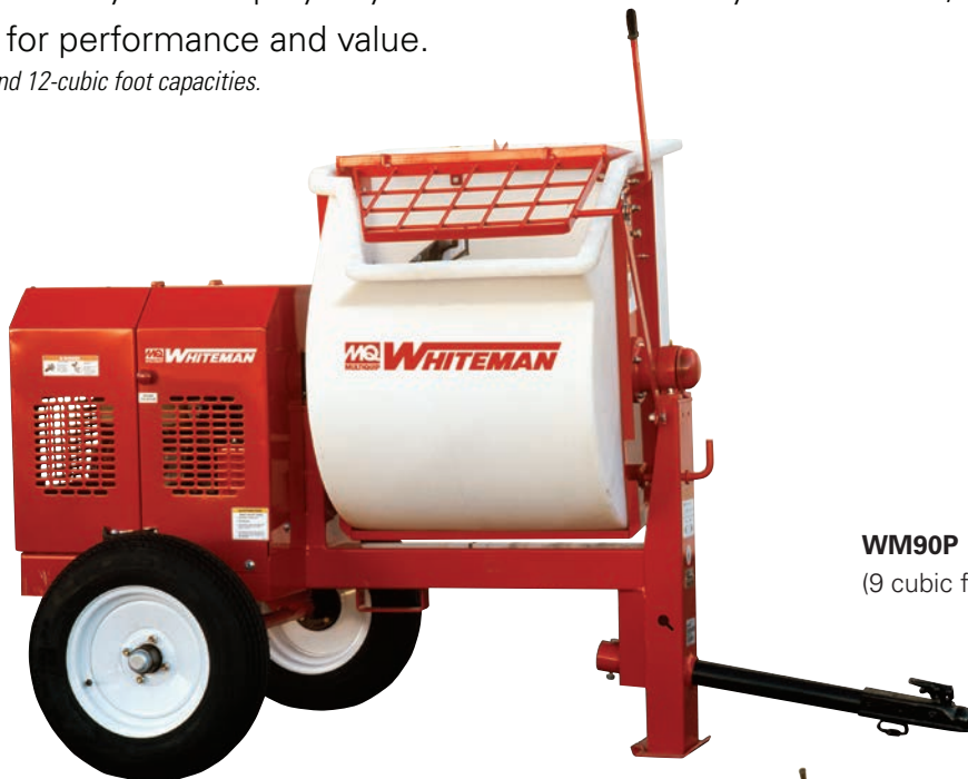
WM90P (9 cubic ft., Poly drum)

Models available in 7-, 9-, and 12-cubic foot capacities.