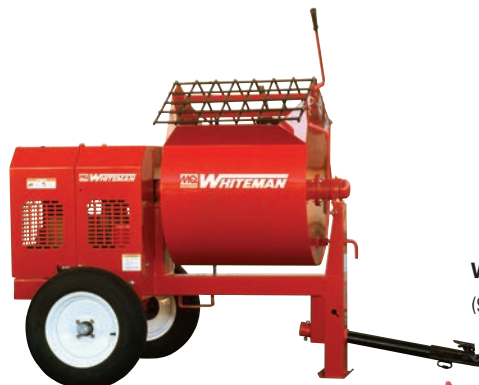
WM90S (9 cubic ft., Steel drum)