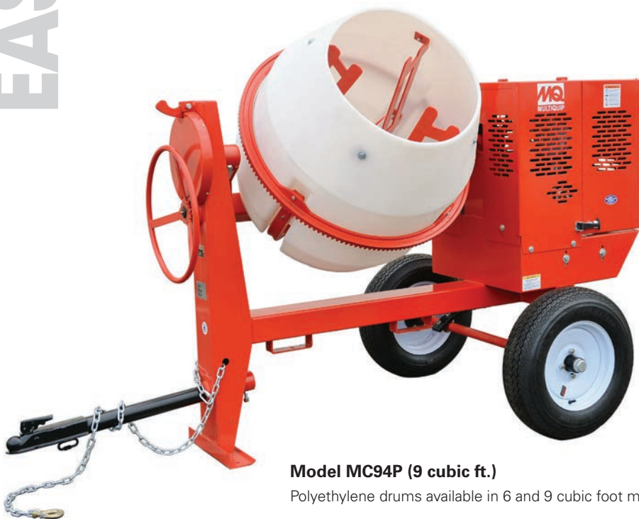
Model MC94P (9 cubic ft.)

The MC12PH concrete mixer handles your biggest and toughest applications. It features a 12 cubic ft. Easyclean™ drum and powerful Honda GX340 engine.