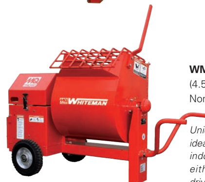
WM45 (4.5 cubic ft., Steel drum) Non-towable

Unique wheelbarrow design ideal for small batch jobs and indoor work. Available with either electric or gasoline drive.