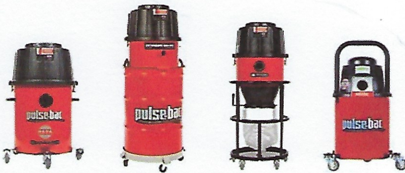
20-gal. Drum 55-gal. Drum Longopac™ Bagger Pulse-Bac® 576